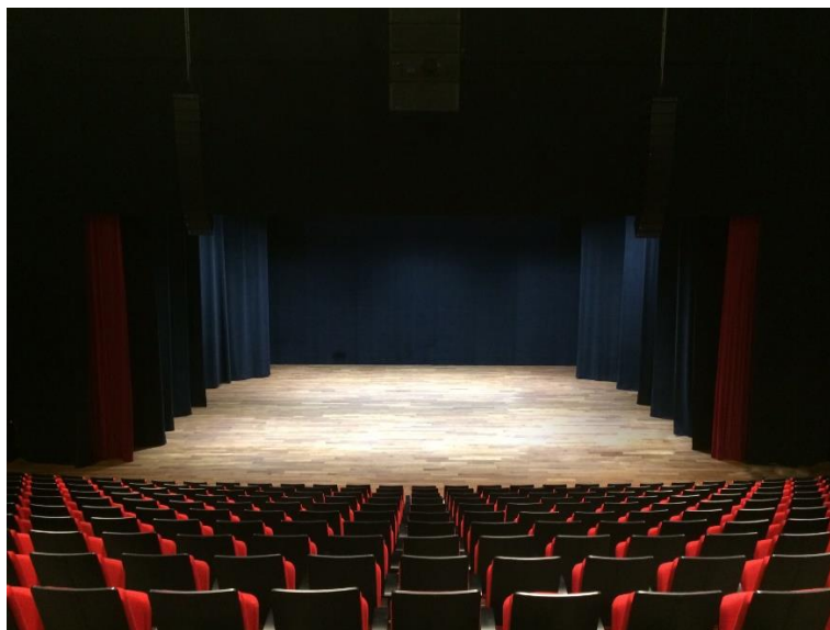
Stage, all seated setting