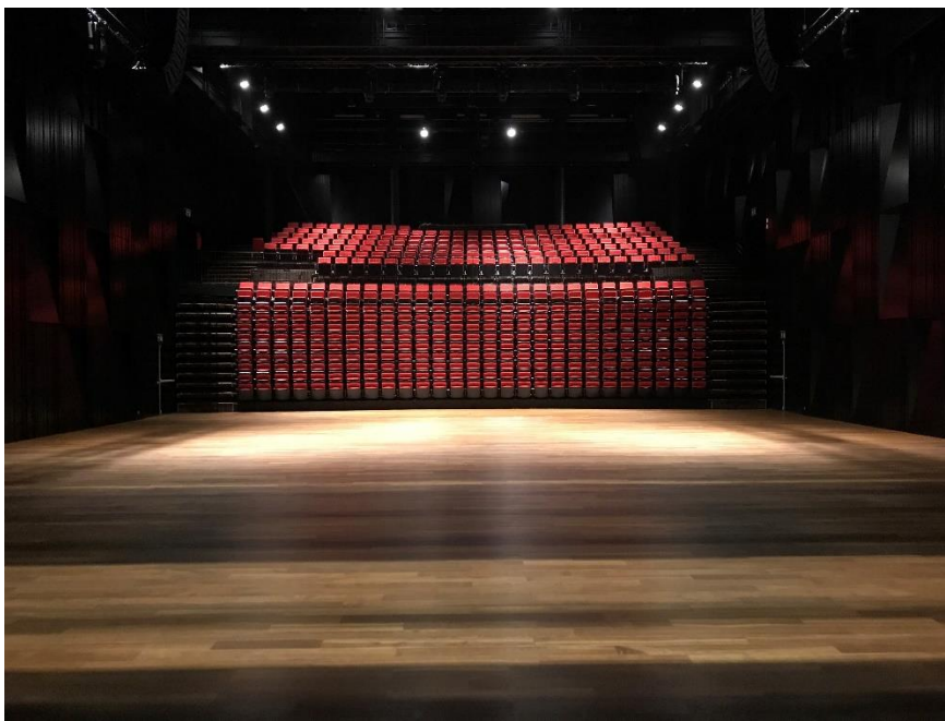
Audience area seen from stage, standing area in front, 172 seats at the back of the hall