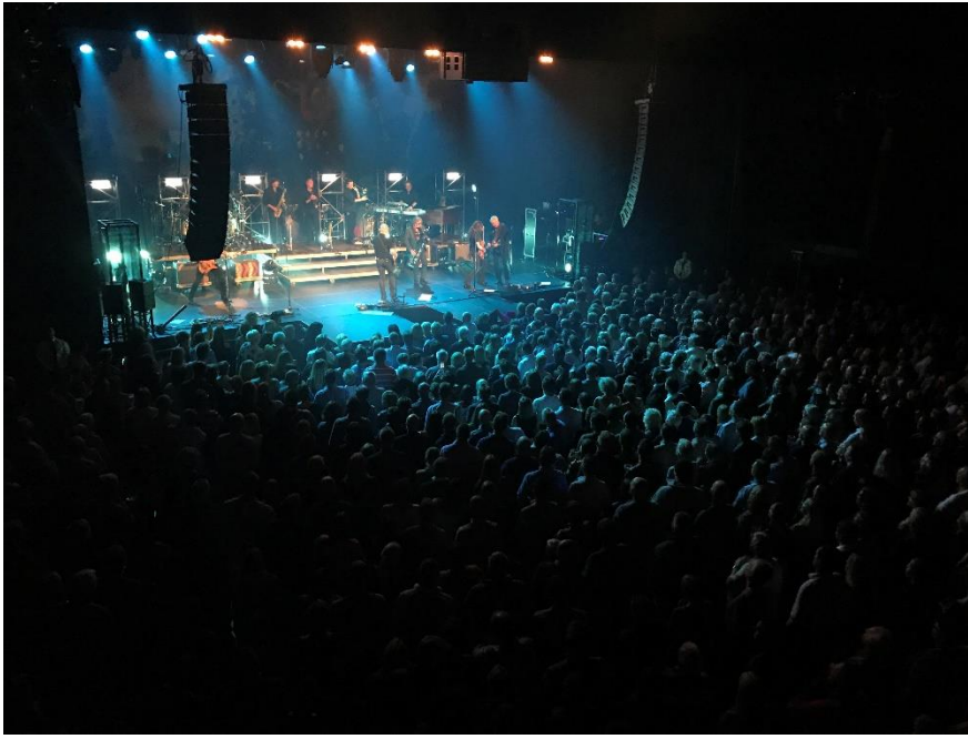
Concert in KF, 700 people standing